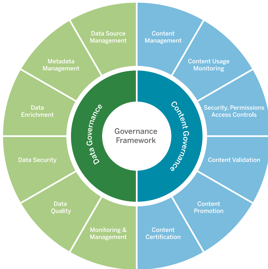
Figure 2: Overall framework combining data and analytics governance

For most modern analytics use cases, a self-service-driven organic approach to governance will lead to greater adoption, deeper insights, and improved business outcomes. As such, this is the approach that should be considered primary for the purpose of this evaluation. In this approach, a subset of content creators, referred to as information stewards in this guide, are primarily responsible for defining and navigating the overall governance process.