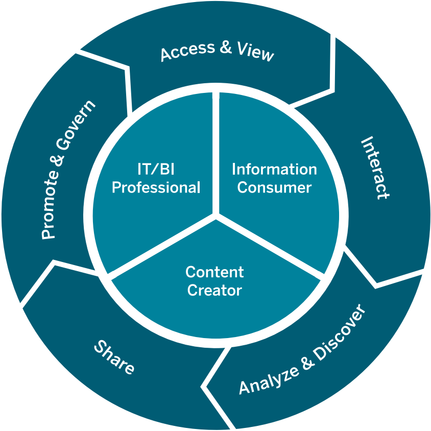
Figure 1: Modern analytics workflow

The modern analytic workflow is a cycle of inter-related capabilities depicted below and is comprised of five key areas which serve as the foundation for this evaluation guide: