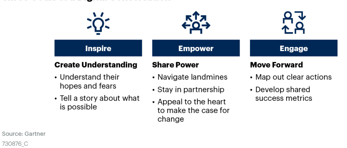
Figure 1. Three Goals of a Digital Conversation