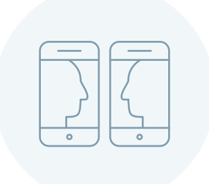
52% of millennials regularly make video calls on their phones. They want face-to-face interaction, even on the go.