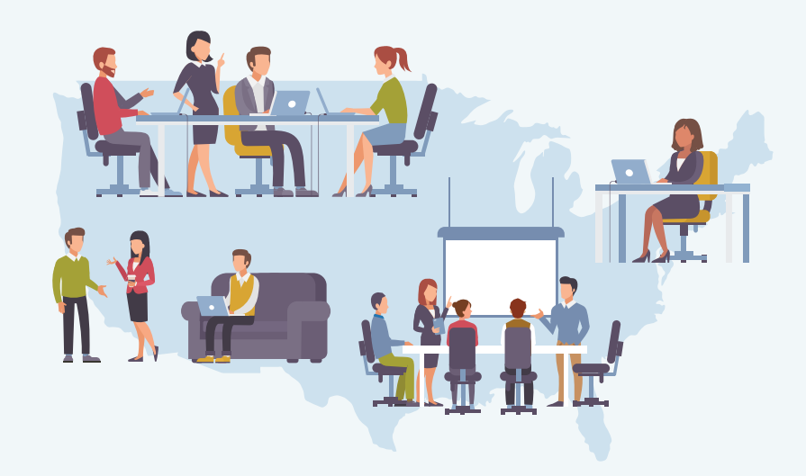
55 million meetings happen each day in the U.S., more than double the number from two decades ago.

Even with all these changes, meetings are still integral to business. They're where decisions are made, relationships are built and results are delivered.